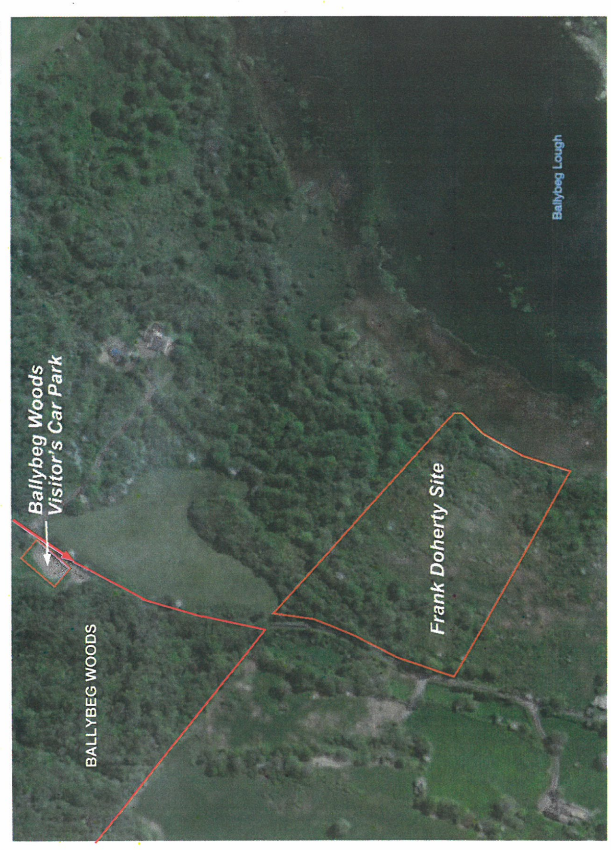
AERIAL VIEW OF FRANK DOHERTY SITE SHOWING PROXIMITY TO BALLYBG WOODS