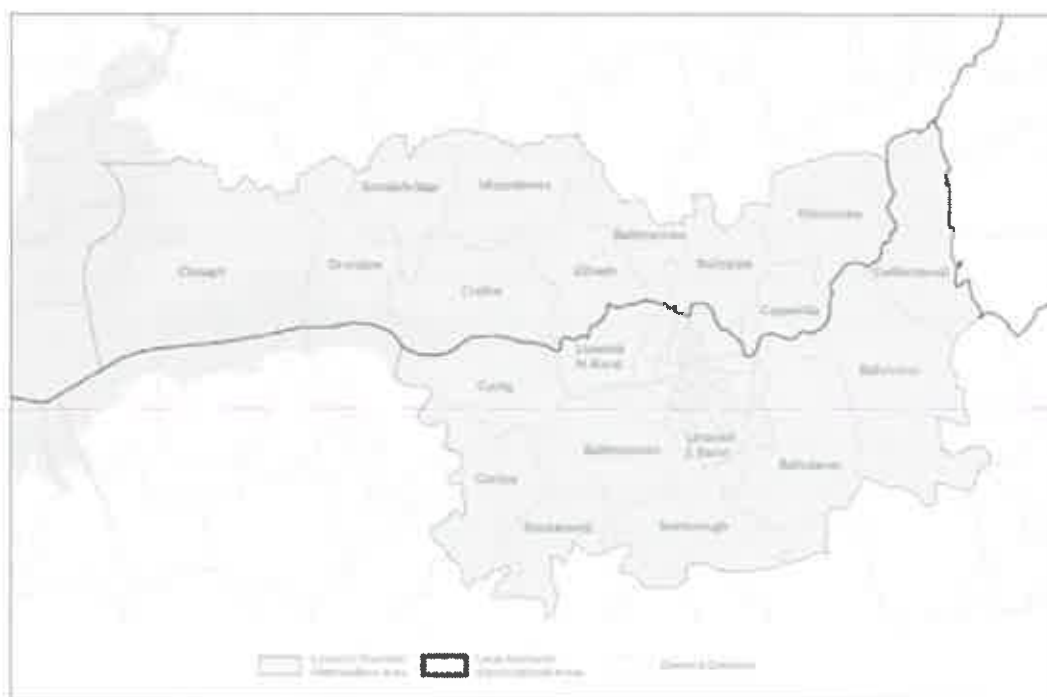
Figure 4.1 Limerick-Shannon Metropolitan Area