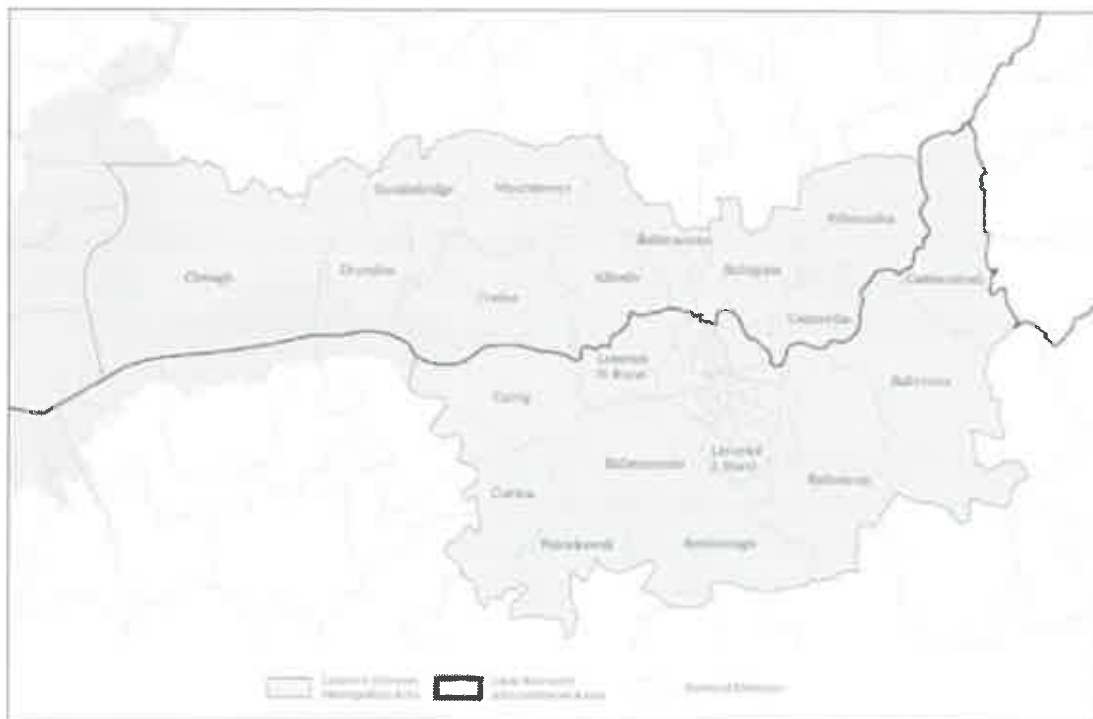
Figure 4.1 Limerick-Shannon Metropolitan Area